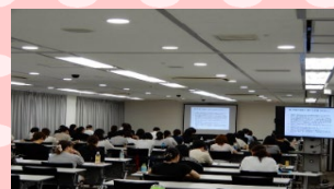
Scene of CRC classroom training

More practical hands-on training is provided to the trainees if required.